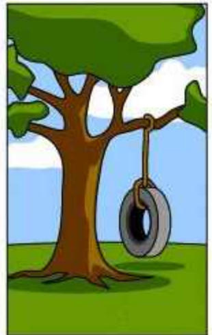
What the customer really needed