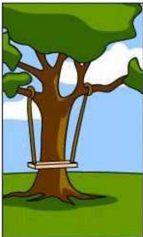
How the Project Leader understood it