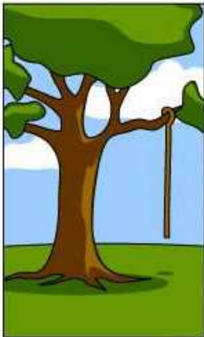
What operations installed