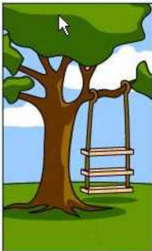
How the customer explained it