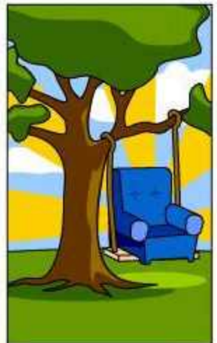
How the Business Consultant described it