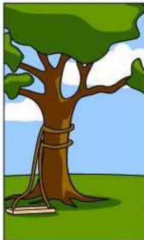
How the Programmer wrote it