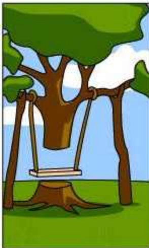
How the Analyst designed it