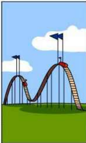
How the customer was billed