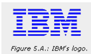
Figure 5.A.: IBM's logo.

We perceive the letters 'I', 'B', and 'M' although the shapes we see, in fact, are only lines of white space of differing length hovering above each other.